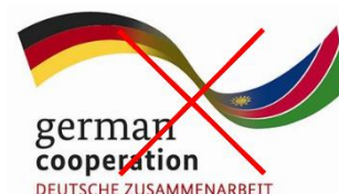
Sample logo German Cooperation Namibia